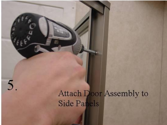
Attach Door Assembly to Side Panels

5. Attach door assembly to side panels with (4) #8 x 1 1/4" square drive screws per side. (Note: screws must seat into screw races securely, alignment is important).