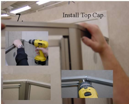
Install Top Cap

6. Level door assembly if necessary. Secure expansion jamb to installed shower door with #8 x 3/4 self-tapping screws at middle and bottom of door, inside shower. (Note: pull side panel out at top or bottom to level door).