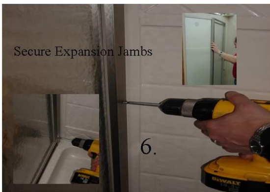
Secure Expansion Jamb

6. Level door assembly if necessary. Secure expansion jamb to installed shower door with #8 x 3/4 self-tapping screws at middle and bottom of door, inside shower. (Note: pull side panel out at top or bottom to level door).